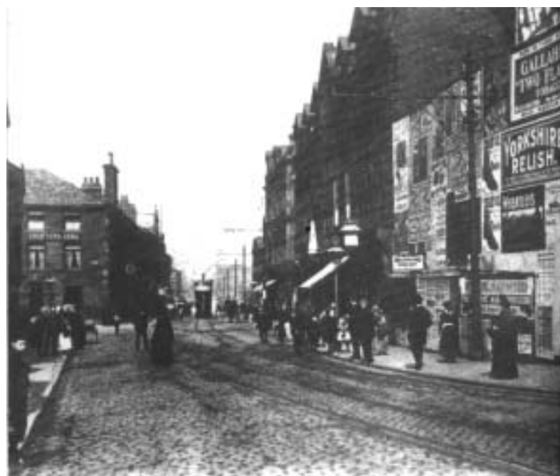
Market Street .1890

Before starting the walks it is not essential to read all of the first section 'WHAT TO LOOK FOR IN WIGAN' instead, the headings and main points (in bold type) can be noted. This section and 'ASPECTS OF WIGAN'S HISTORY' can be read later.