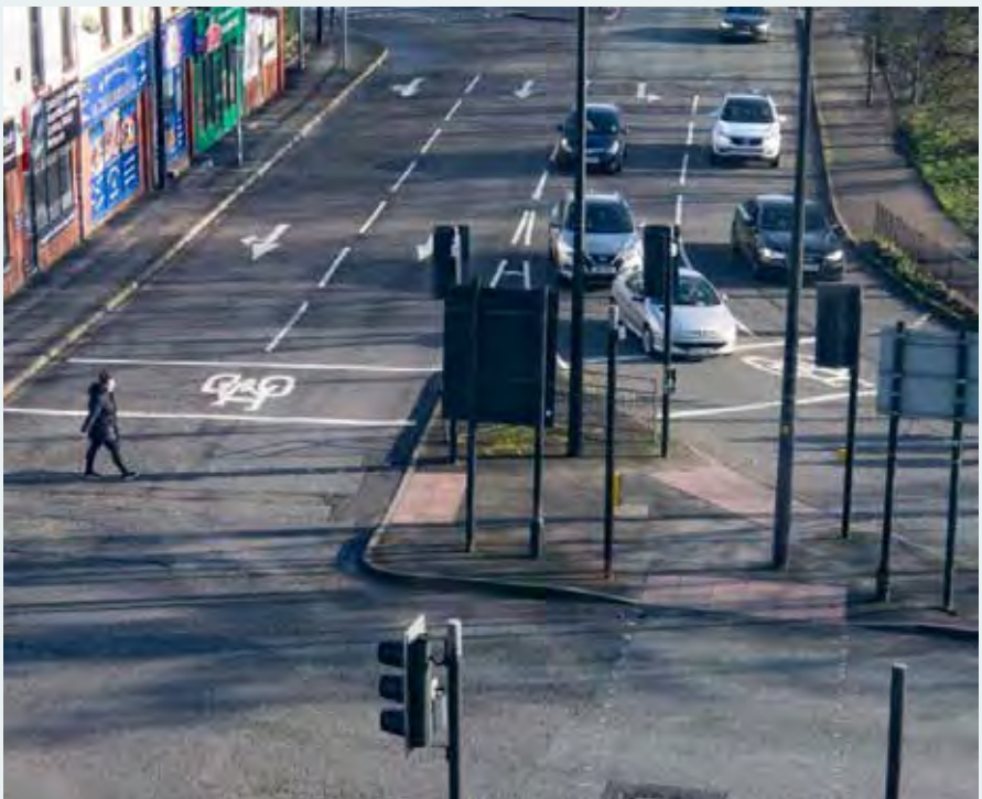
Darlington Street/King Street junction

Providing new crossings and more space for pedestrians by widening pavements and with additional crossing points on all sections of this busy junction, will make it much safer to cross Riverway to get to many town centre destinations.