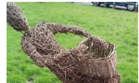
Shevington in Bloom £1,300