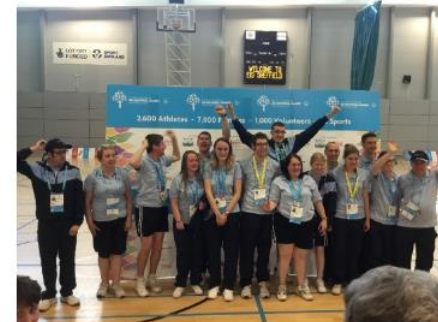
Bryn Specials Badminton Club £2,030