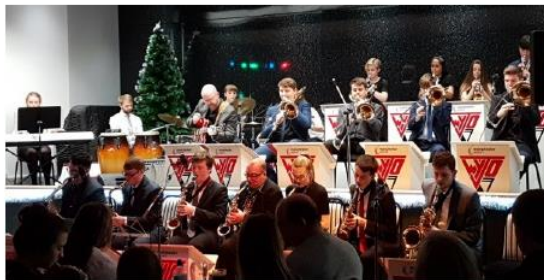
Beyond Wigan Pier £30,510