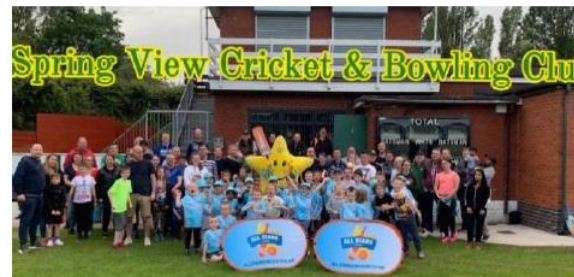
Springview Cricket Club £2,000