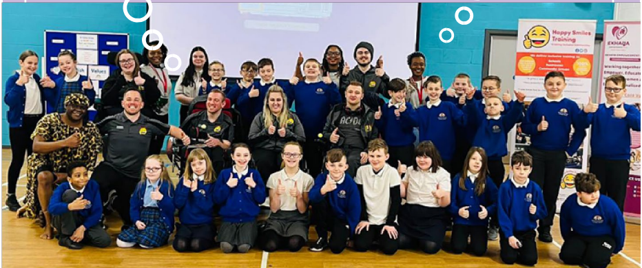
Ekhaya Empowerment, Happy Smiles CIC & Everything Human Rights working in partnership to carry out Hate Crime Awareness sessions in local schools.