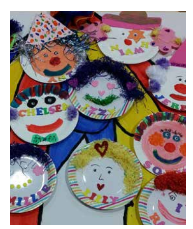
Short Breaks Summer Holiday Club