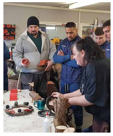
Wigan Warriors visiting Men's sheds