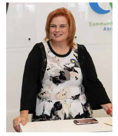
MissPlaces - Made In Wigan

Made in Wigan is a project that aims to work with all Anchor Institutions and the Private Sector to ensure there is a 'line of sight' of Social Enterprise's and Community Businesses that will empower local people to spend locally, whilst be trained to showcase their 'special something' and turn it into a service that meets the needs of the local community.