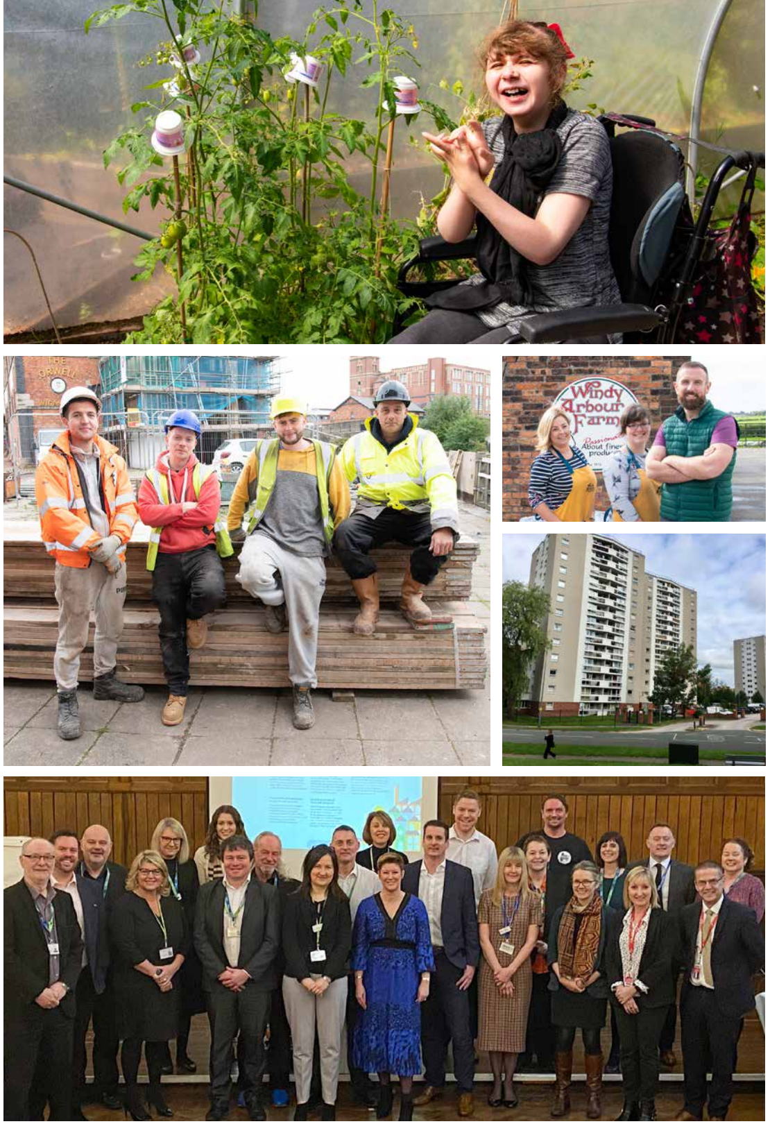
The Wigan borough partnership