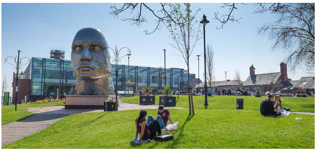
The Wiend, Wigan