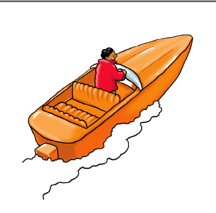
I can see a speed boat.