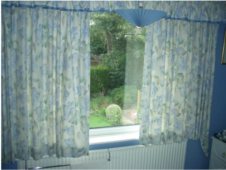
a window and curtains