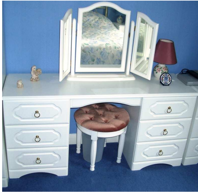
a dressing table