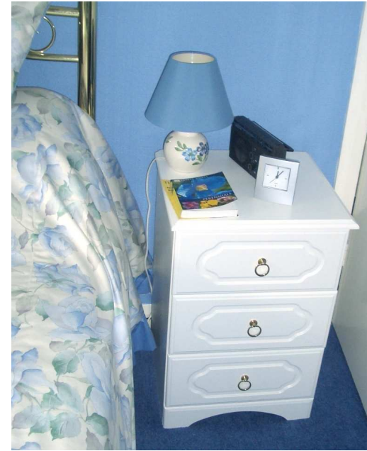
a bedside table