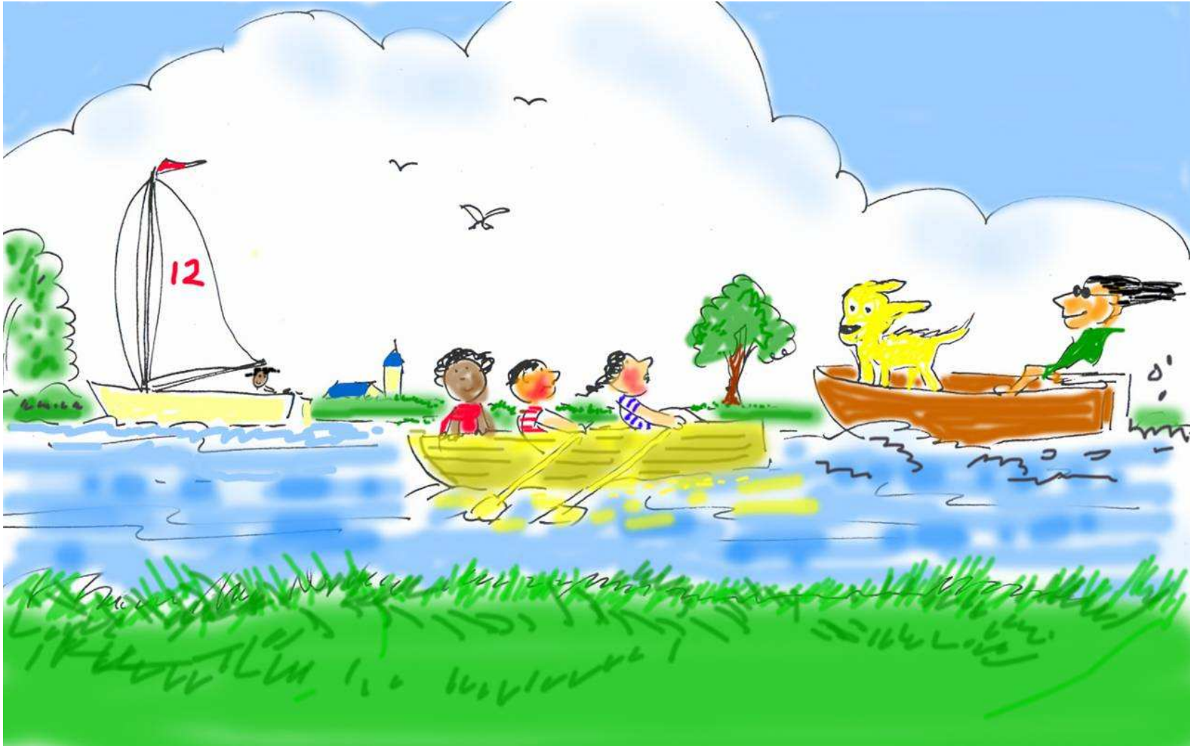
boats on the river