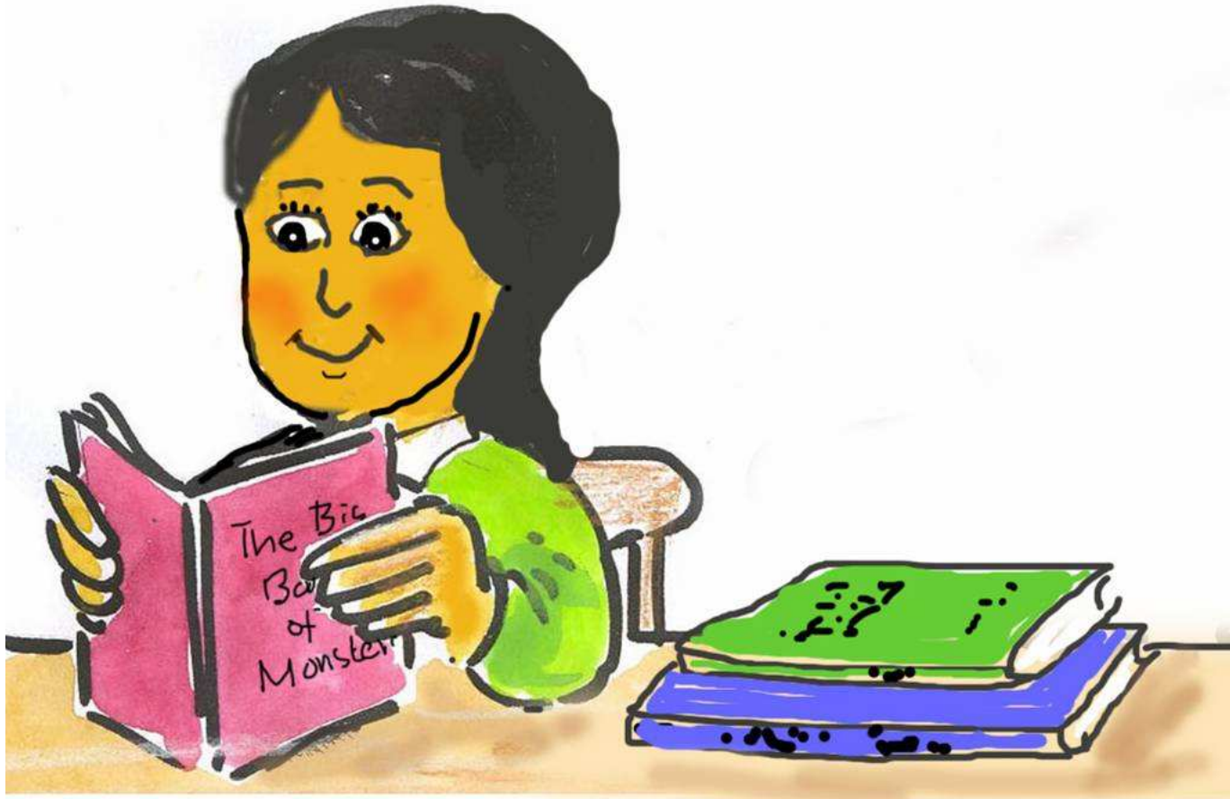
looking at books