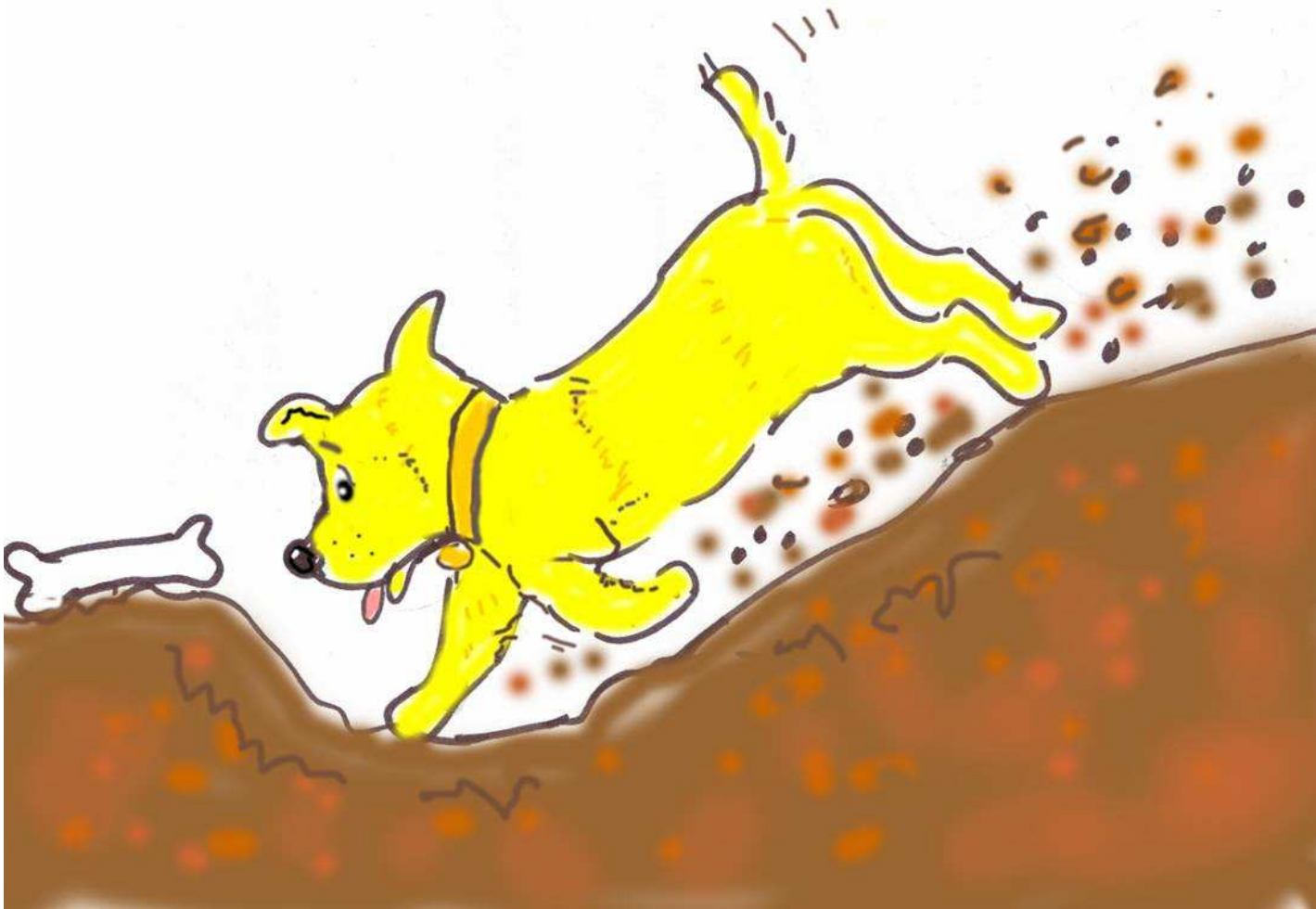
digging in the soil