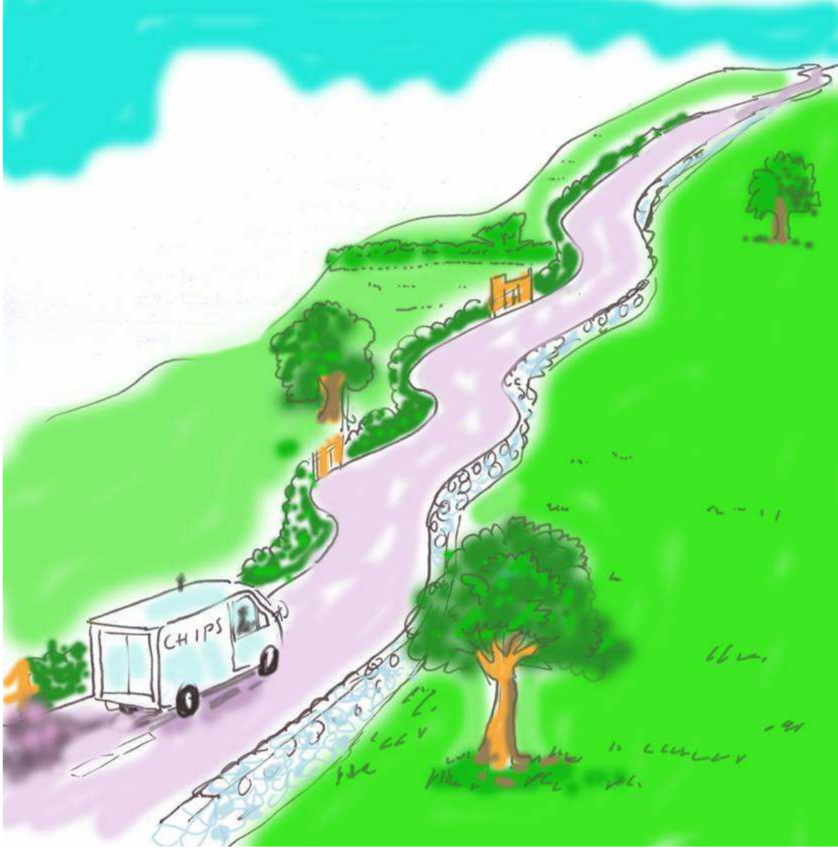
The van will chug up the long hill.