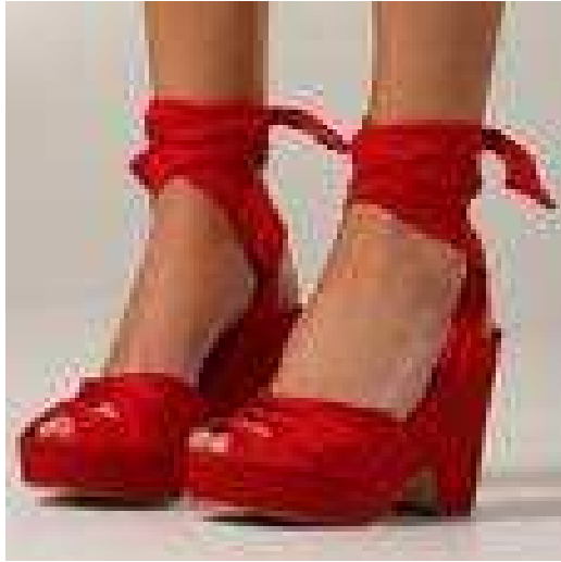
some red shoes