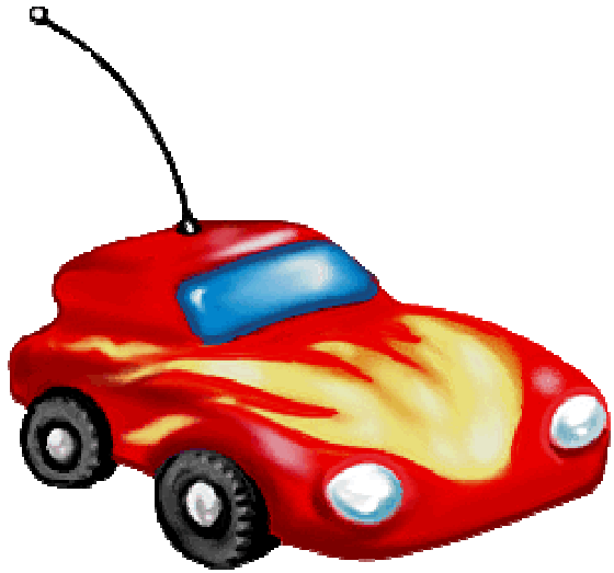
a red car