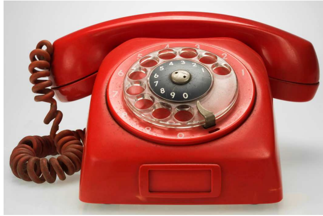
a red telephone