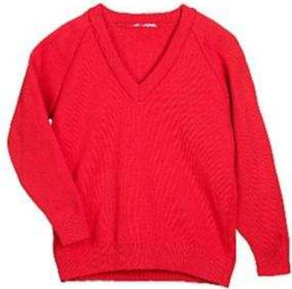
a red jumper