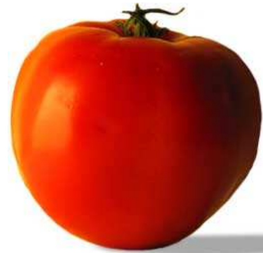
a red tomato