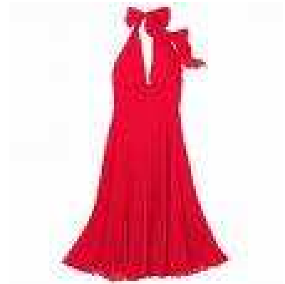
a red dress