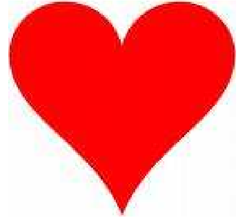
a red heart