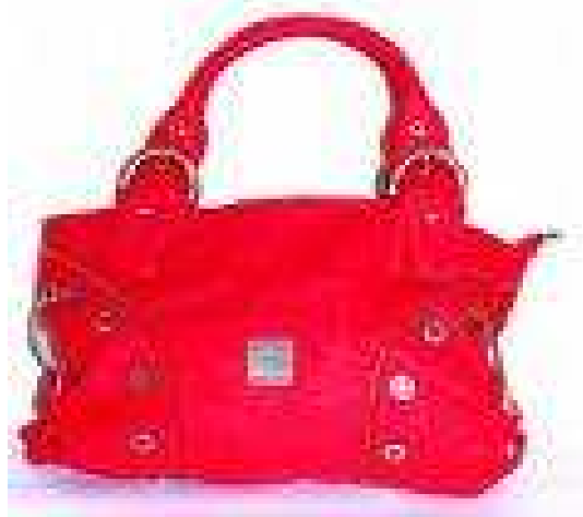
a red bag