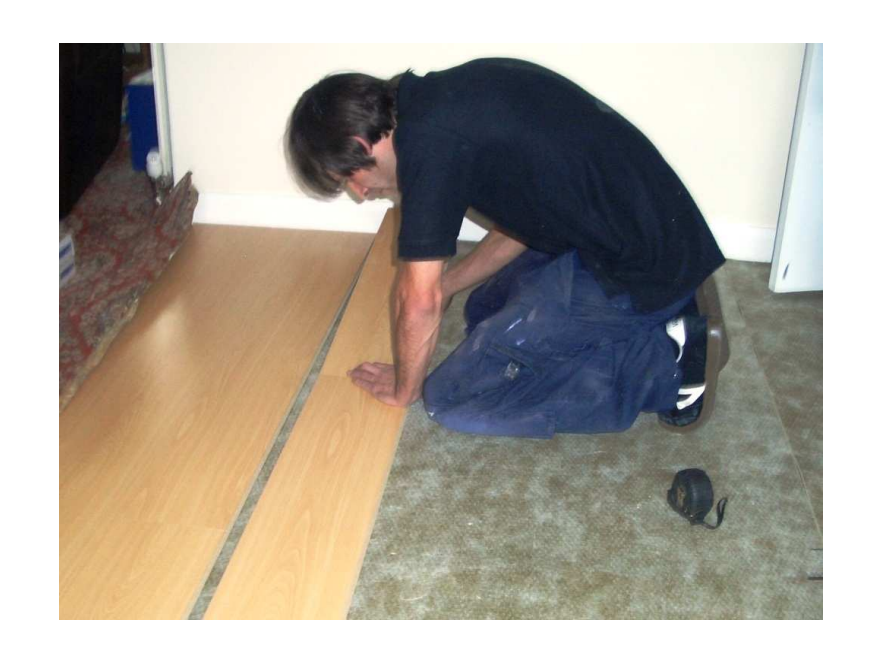
A floor layer lays flooring.