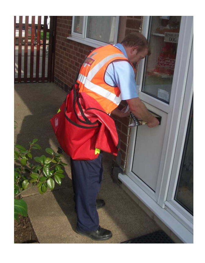
A postman delivers letters.