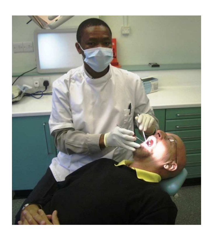
A dentist looks after teeth.