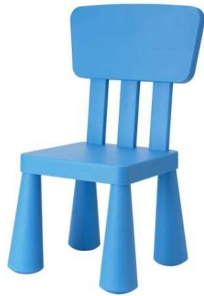
a blue chair