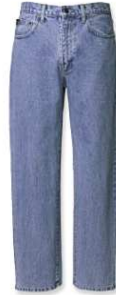
some blue jeans