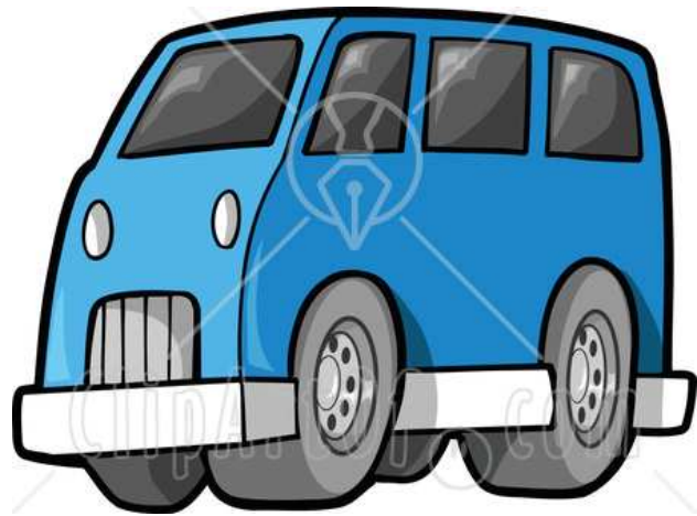
a blue van