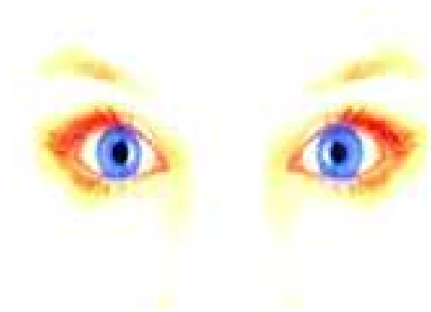
some blue eyes