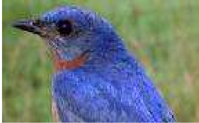
a blue bird