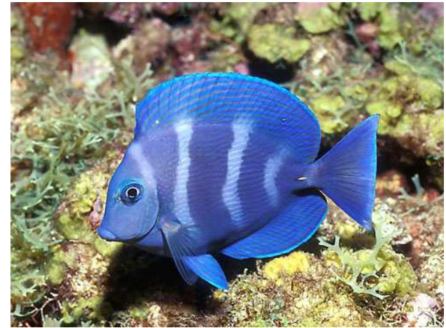
a blue fish