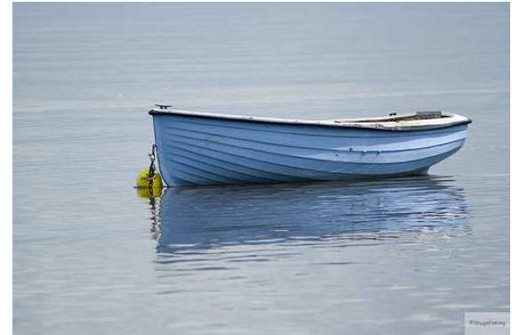
a blue boat