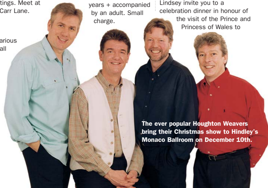
The ever popular Houghton Weavers bring their Christmas show to Hindley's Monaco Ballroom on December 10th.

Late night and Sunday shopping is in full swing in Leigh and Wigan where all car parks are free up to Christmas on Thursdays from 6-9pm and on Sundays.