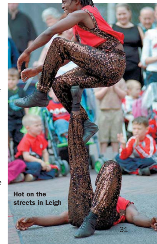
Hot on the streets in Leigh

Throughout June, July and August the Turnpike Gallery will be running art workshops for all ages. Details from the gallery on 01942 404469.