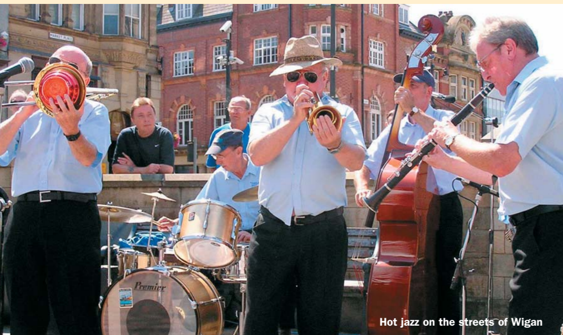
Hot jazz on the streets of Wigan

■ By phone - using credit or debit cards by calling 01942 825677 (10am to 5pm Monday to Friday)