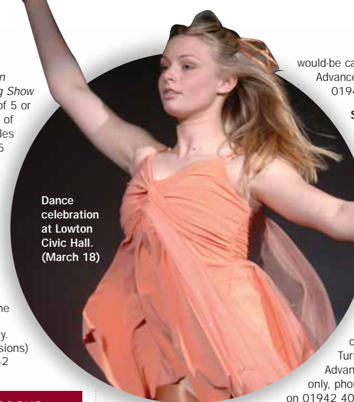
Dance celebration at Lowton Civic Hall. (March 18)

would-be canal boat painters. Advance reservations only, 01942 828128. FREE