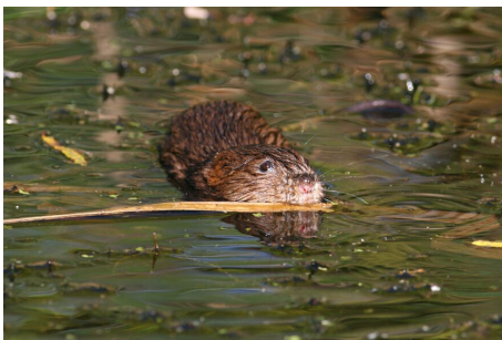
Water Vole (see Appendix A for Acknowledgements)

7.41 As at 2007 water voles are afforded partial protection by the Wildlife and Countryside Act 1981. Their places of shelter or protection are protected but not the voles themselves.