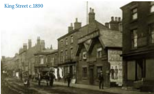
King Street c.1890