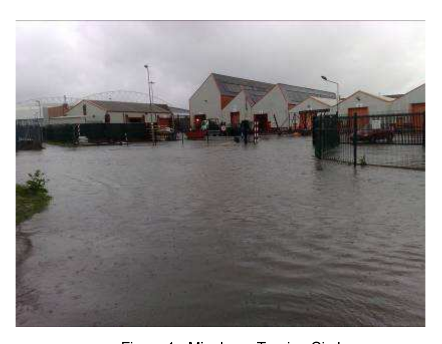
Figure 1 - Miry Lane Turning Circle

Sand bags and pumps were deployed to site to limit damage to properties.