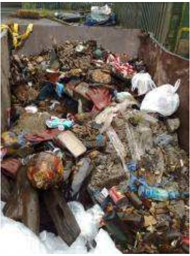
Figure 4 – Debris removed from Culvert In total there was in excess of 32 tonnes of silt removed from the culvert and 4 skips of debris.