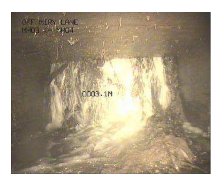
Figure 3 – CCTV Screen shot of Blockage

As CCTV survey the culvert and syphon carried out on behalf of the Environment Agency indicated that although the siphon was clear of obstruction and working efficiently a significant blockage upstream of the siphon was identified. See Figure 3