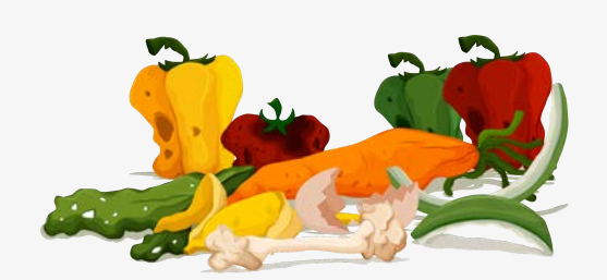
800 tonnes of food waste saved per year the value of which totals £1.6m